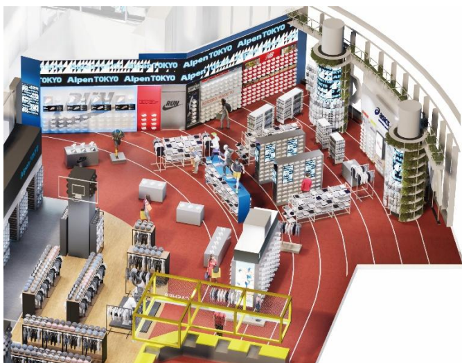
*Left image: View from the Yasukuni-dori entrance

Alpen Tokyo's first floor will be renovated on July 1st! We will be installing "On" shop-in-shops and large, impressive signage to visually communicate the latest gear information and product appeal. On July 19th, we will be holding an event to challenge the Guinness World Record™ for the most pairs of running shoes sold in a day!